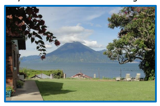
Facilitated by Marjory and Peter Bankson (with Seekers Church since 1976)

After our week in the village we'll stay 3 nights at Las Buenas Nuevas, a missionary retreat center in Panajachel. The cottages are in a beautiful garden setting overlooking Lake Atitlan. This will be our base camp for day trips across the lake to visit other missions and ministries. We'll also have be able to visit the Mayan market in Chichicastenango.